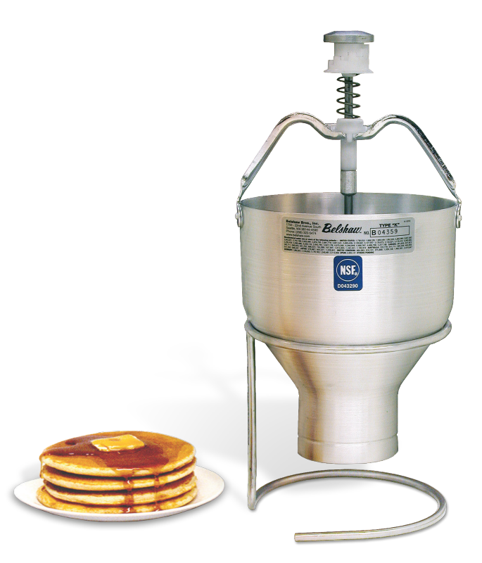
Type K Pancake Dispenser with Holder